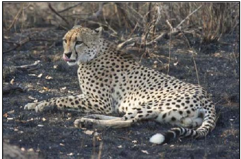
Clockwise from top left : Fork-tailed Drongo; Lilac-breasted Roller; Cheetah; Southern Yellow-billed Hornbill