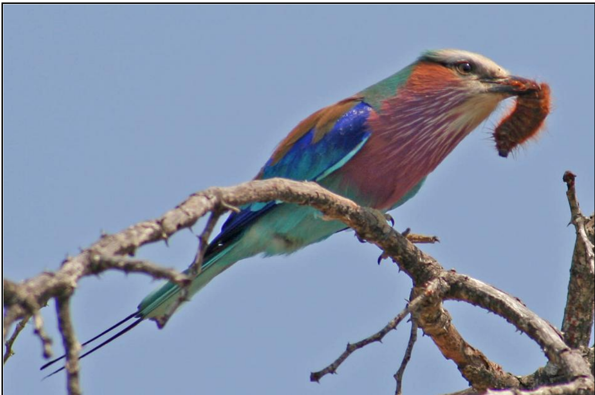
Lilac-breasted Roller, with hairy caterpillar