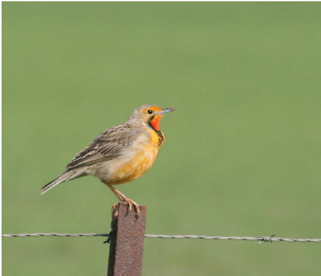
Cover photo: Cape Longclaw, Memel.